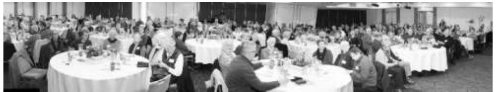
Creswick Garden Club Learning Day at RACV Goldfields Resort.