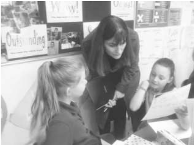
Katy Haire – a Deputy Secretary of the Department of Education and Training.