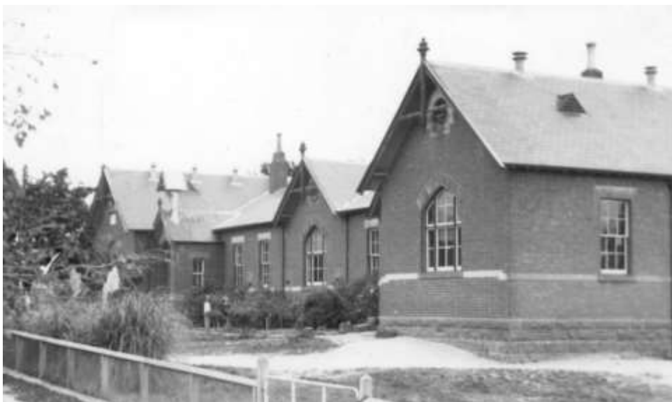
An early photograph of Creswick Primary School No. 122